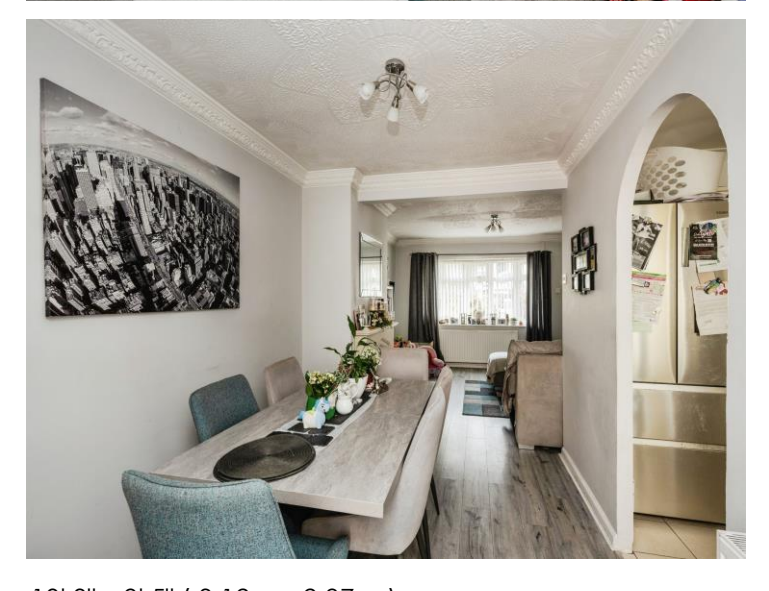
10' 3" x 9' 5" ( 3.12m x 2.87m )