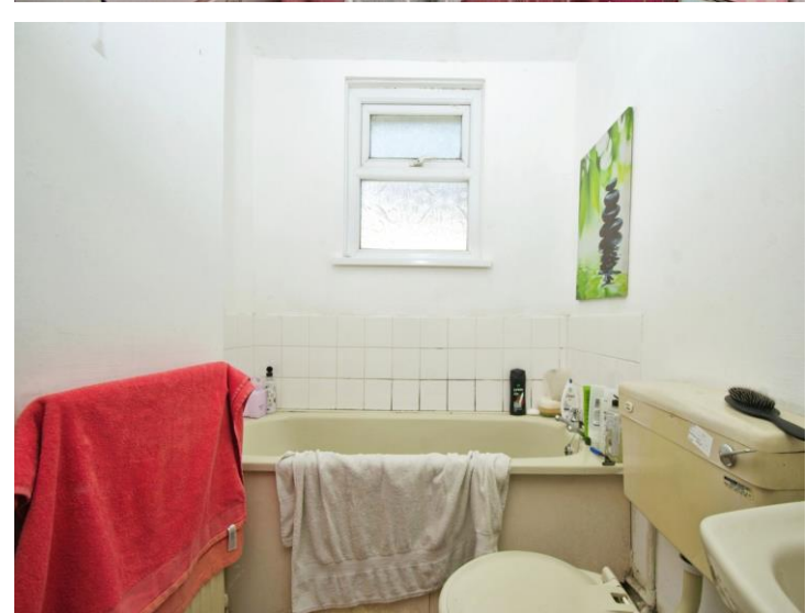
11' 2" Max x 12' 5" Max ( 3.40m Max x 3.78m Max )