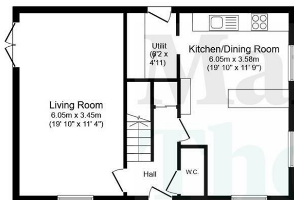
Ground Floor Floor area 53.9 m 2 (580 sq.ft.)