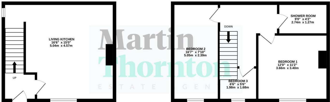
1ST FLOOR 431 sq.ft. (40.0 sq.m.) approx.

TOTAL FLOOR AREA : 738 sq.ft. (68.5 sq.m.) approx.