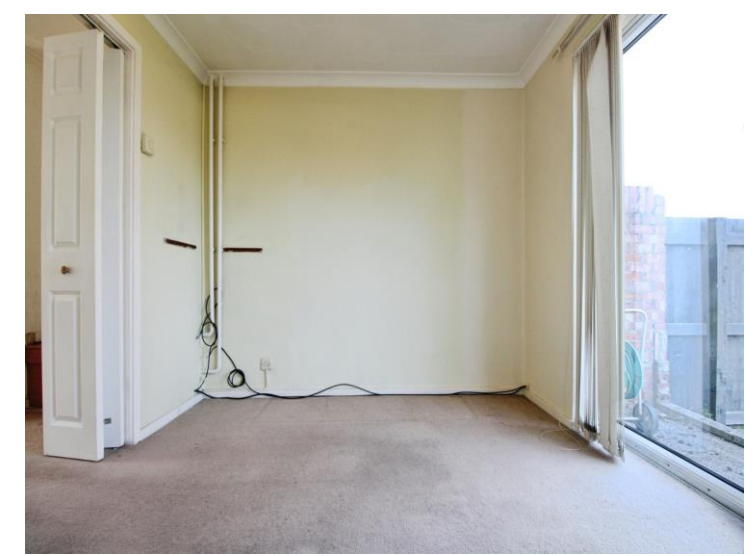
10' 7" max x 7' 5" max ( 3.23m max x 2.26m max )