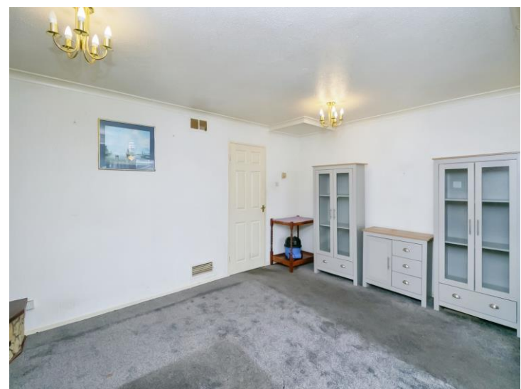
8' 2" x 6' 9" ( 2.49m x 2.06m )