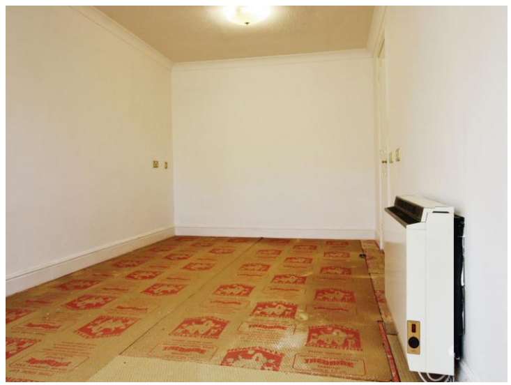
T.V. point, power points, electric radiator, bay window to rear