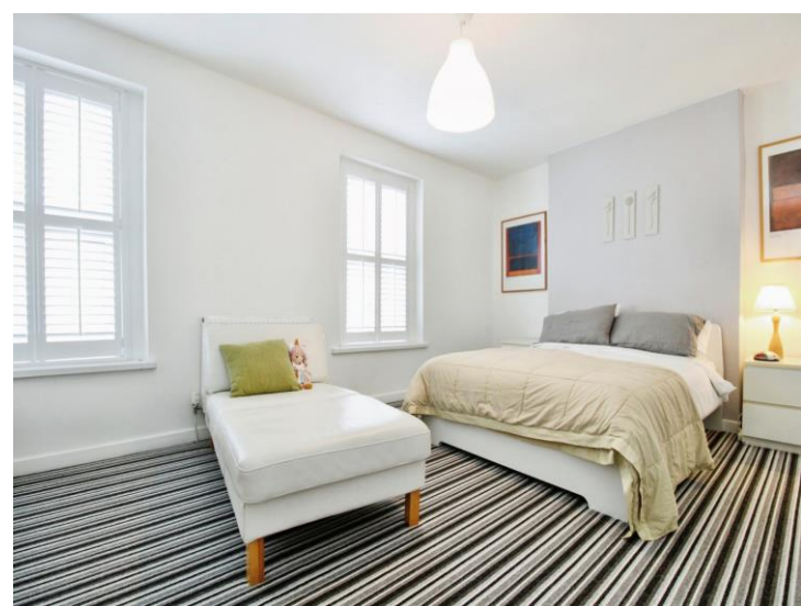
13' x 7' 8" ( 3.96m x 2.34m )