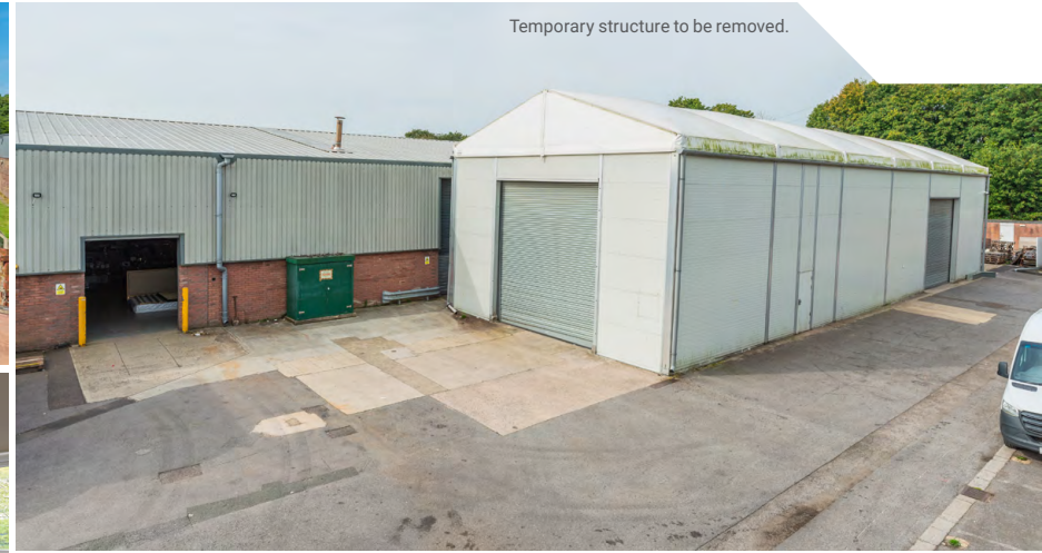
Temporary structure to be removed.