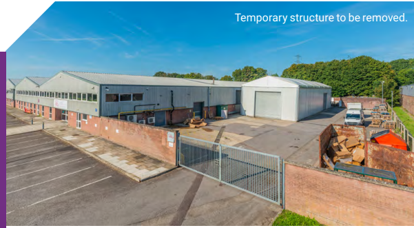
Temporary structure to be removed.

There is plentiful car and lorry parking to the front of the premises and the main access way is a one-way system shared with Hub 2.