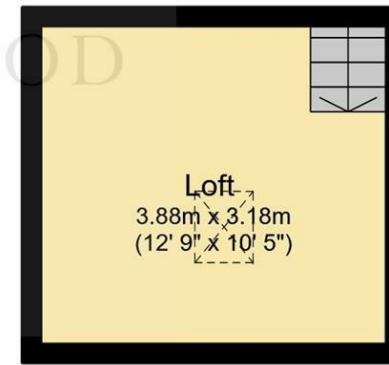
Second Floor Floor area 12.3 sq.m. (133 sq.ft.)

Total floor area: 61.9 sq.m. (666 sq.ft.)