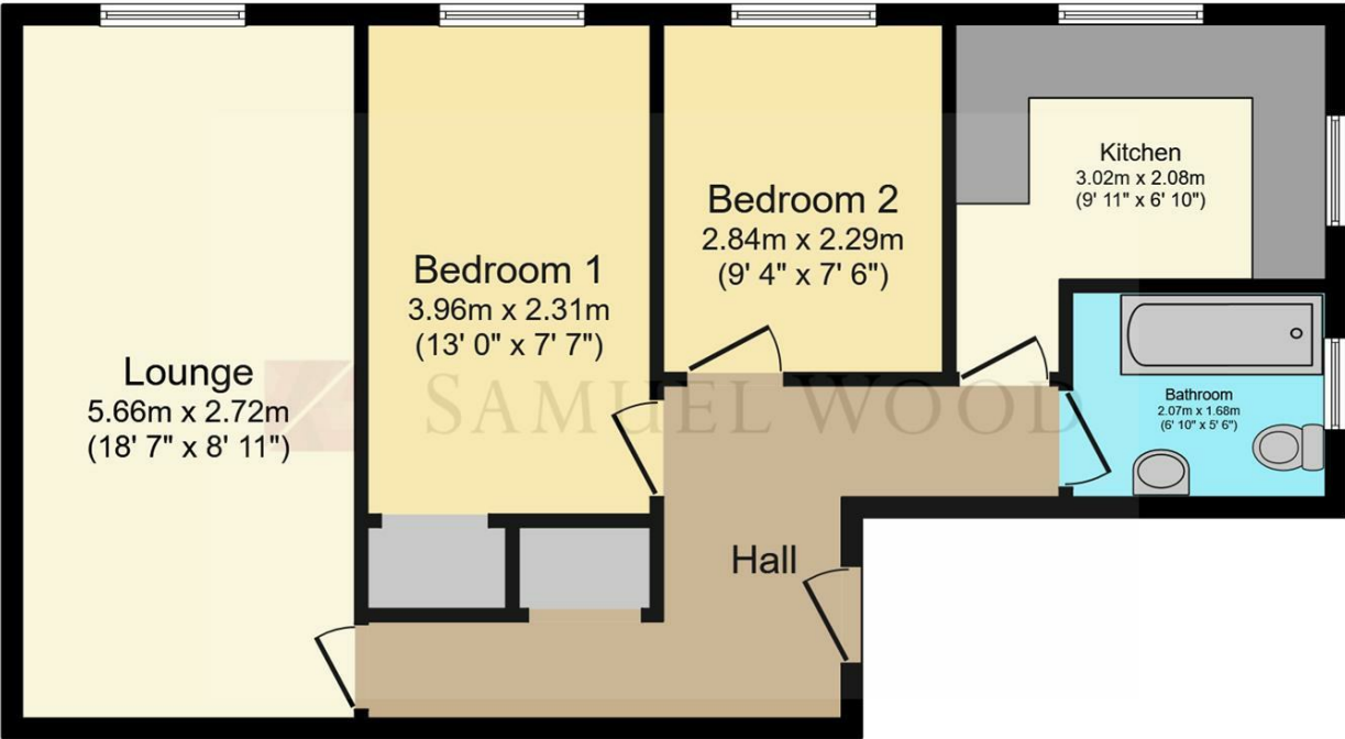
Floor Plan Floor area 53.1 sq.m. (572 sq.ft.)

Total floor area: 53.1 sq.m. (572 sq.ft.)