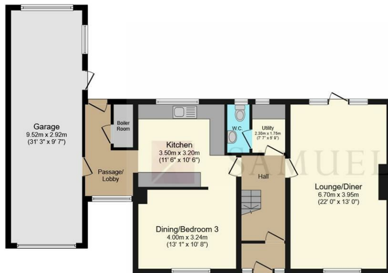
Ground Floor Floor area 104.4 m 2 (1,124 sq.ft.)