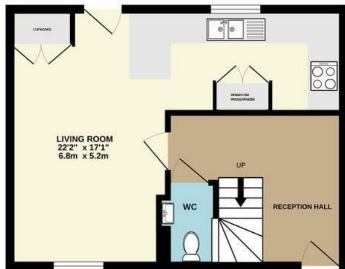
GROUND FLOOR 376 sq.ft. (35.0 sq.m.) approx.