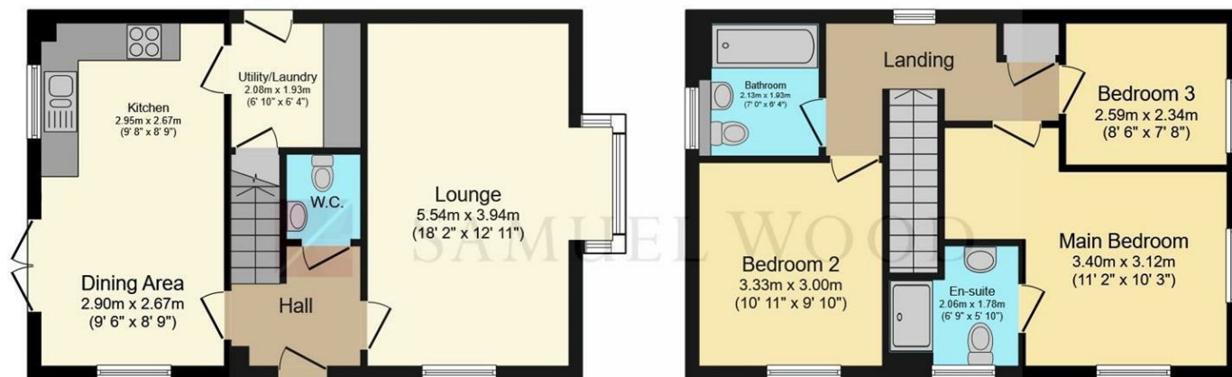
Ground Floor Floor area 47.9 m 2 (515 sq.ft.)