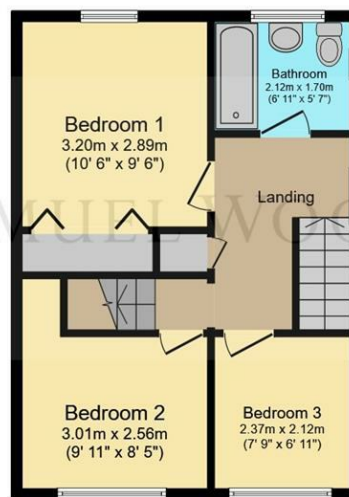
First Floor Floor area 37.2 m 2 (400 sq.ft.)