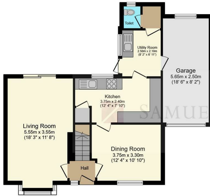
Ground Floor Floor area 69.8 sq.m. (751 sq.ft.)