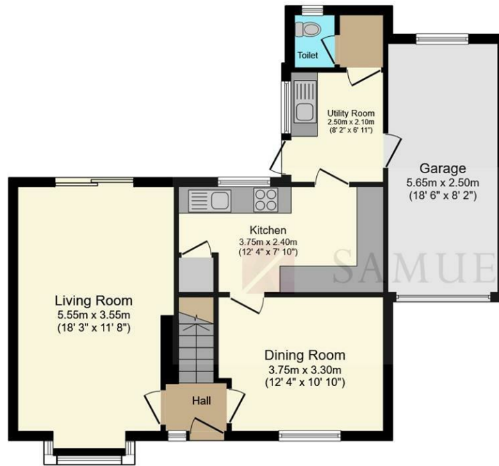
Ground Floor Floor area 69.8 sq.m. (751 sq.ft.)