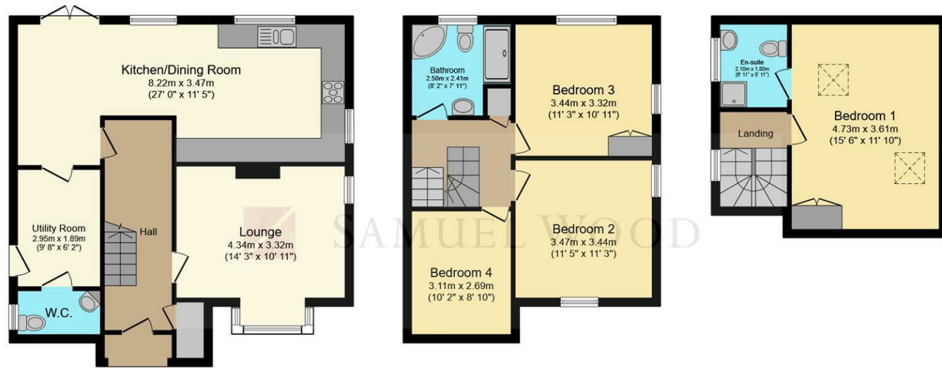
Ground Floor Floor area 63.6 m 2 (684 sq.ft.)