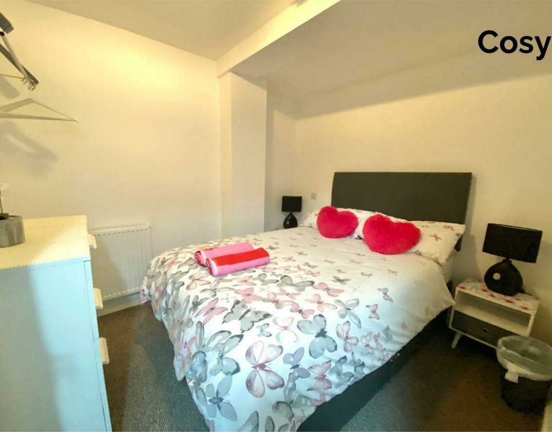
Cosy Apt 1