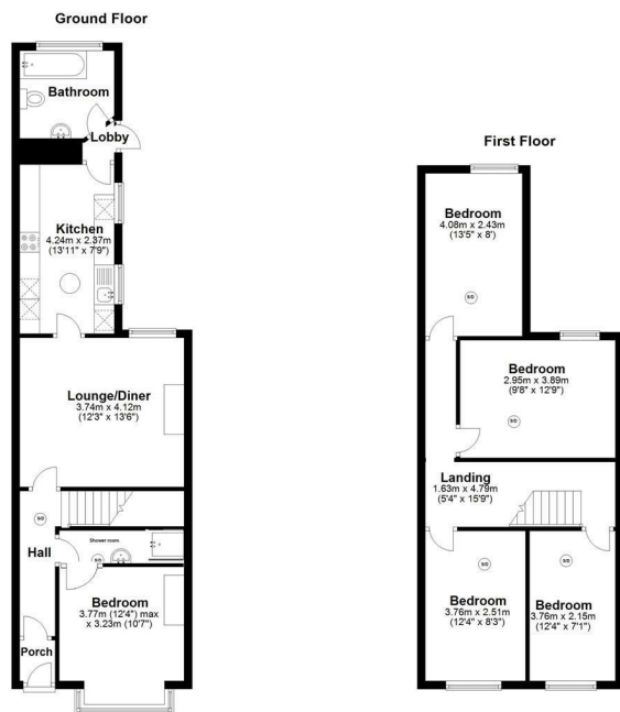
74 Raddlebarn Road, Birmingham