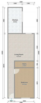
Pershore Road Ground Floor