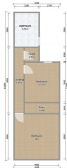
Pershore Road First Floor