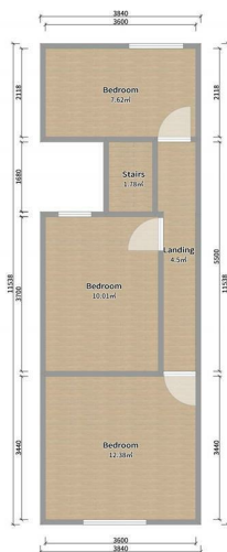
Warwards Lane First Floor