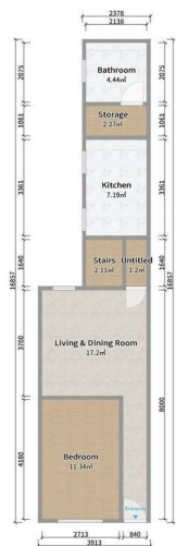
Warwards Lane Ground Floor