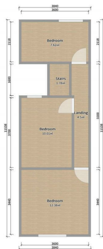
Warwards Lane First Floor