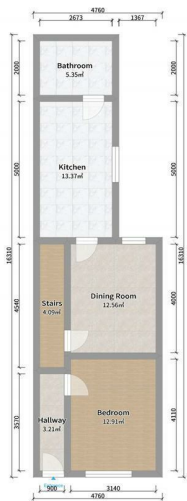
Warwards Lane Ground Floor