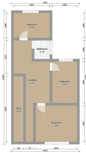
Warwards Lane First Floor