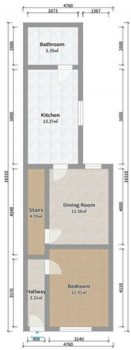
Warwards Lane Ground Floor