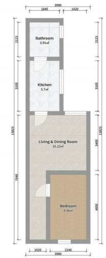
Milner Road Ground Floor