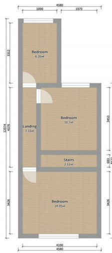
Milner Road First Floor