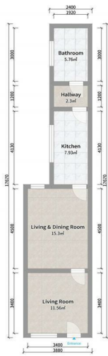
Milner Road Ground Floor