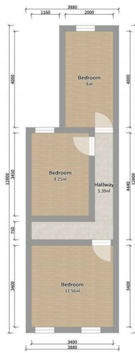
Milner Road First Floor