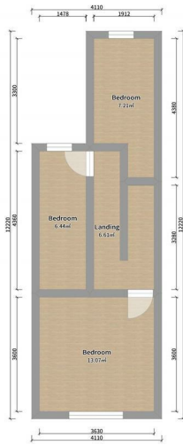
Gristhorpe Road First Floor