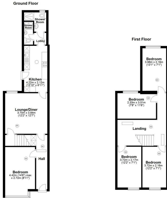
3 Manilla Rd, Selly Park, Birmingham