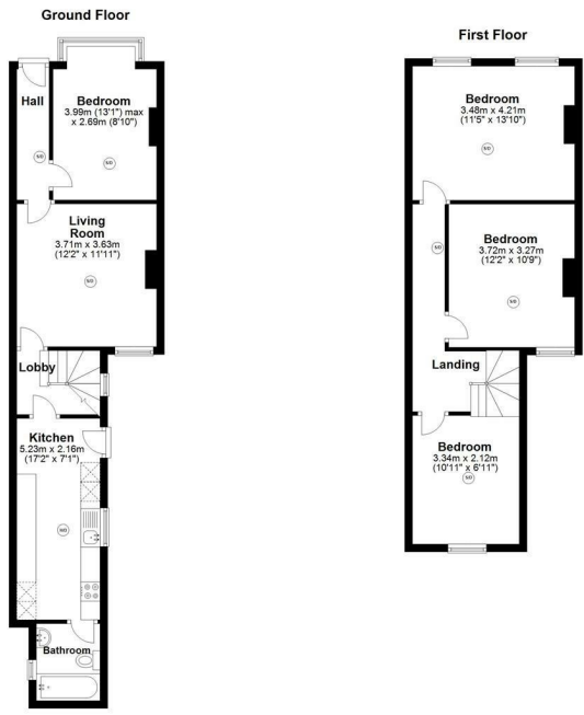
91 Warwards Lane, Selly Oak, Birmingham