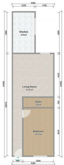
Pershore Road Ground Floor