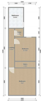
Pershore Road First Floor