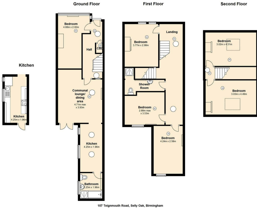
107 Teignmouth Road, Selly Oak, Birmingham