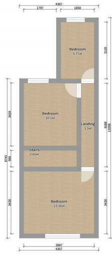
Westminster Road First Floor