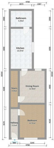
Warwards Lane Ground Floor