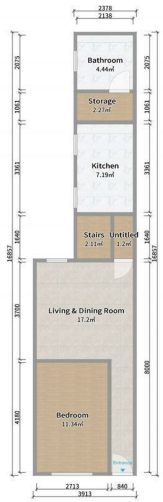
Warwards Lane Ground Floor