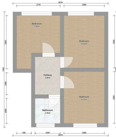
Tealby Grove First Floor