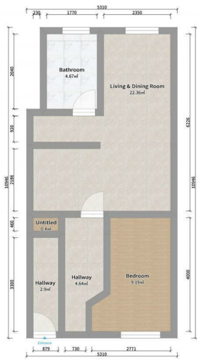
Tealby Grove Ground Floor