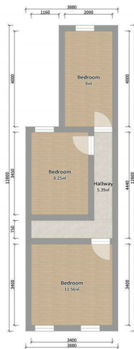
Milner Road First Floor