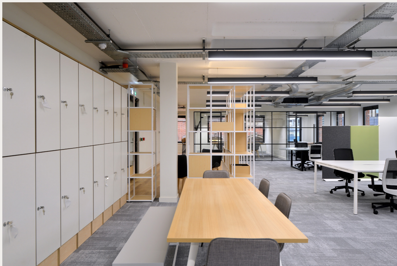
indicative photography of proposed refurbishment