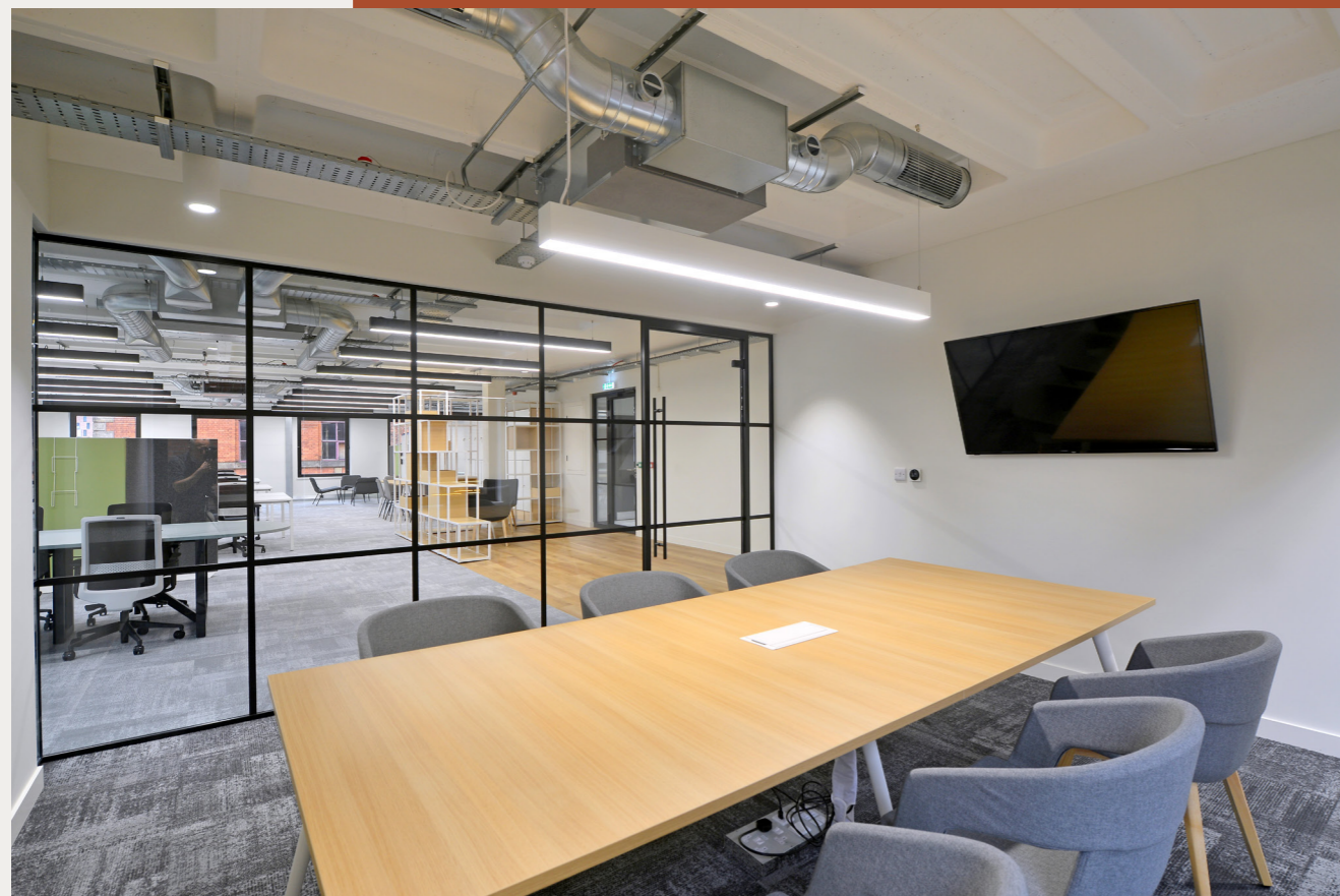
indicative photograph of proposed refurbished

All prices quoted are excluding but may be liable to VAT.