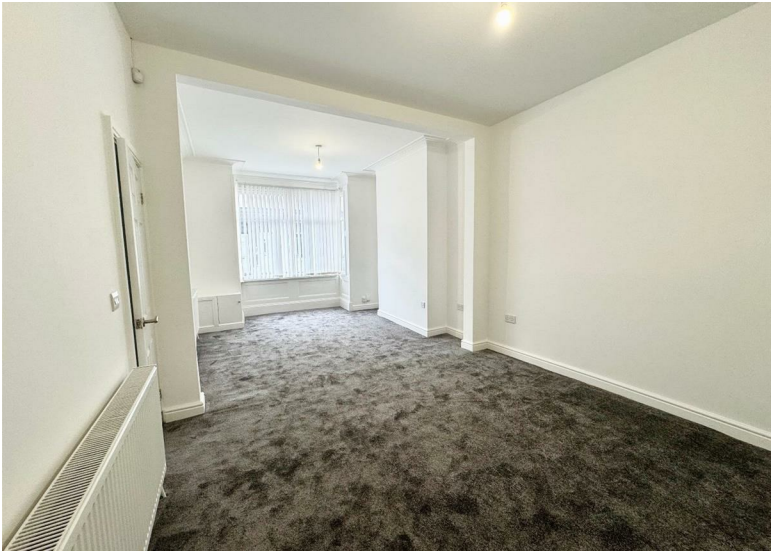
Entrance Hallway Via front door with carpet and radiator.

Lounge Double glazed window to front aspect, two radiators, carpet flooring, storage cupboard and access to kitchen.