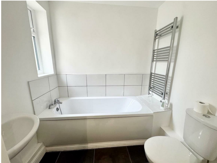
Double glazed window to side aspect, bath, wash hand basin, WC, part tiling and heated towel rail.