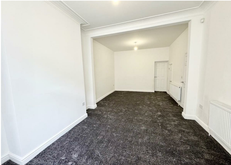
Bedroom Double glazed window, carpet and radiator.

Bedroom Double glazed window to rear aspect, carpet and radiator.