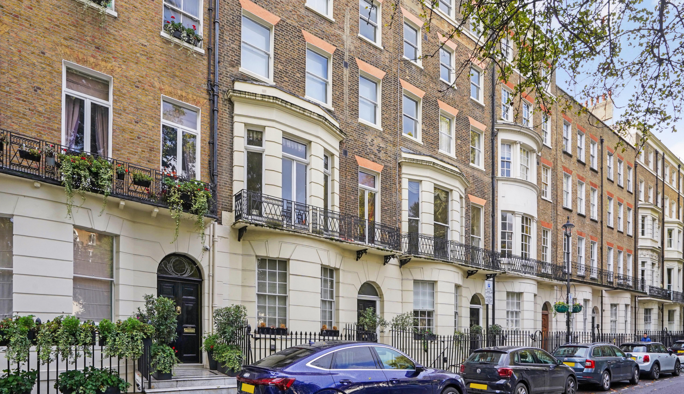
Montagu Square, Marylebone WIH