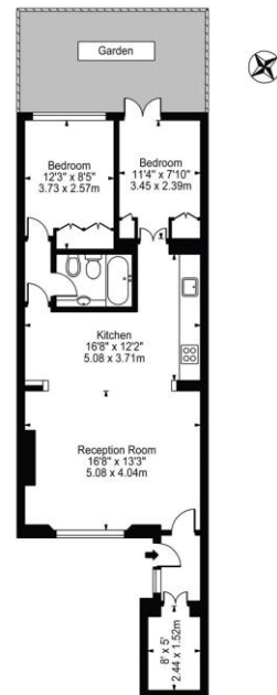
Lower Ground Floor For Illustration Purposes Only - Not To Scale

This floor plan should be used as a general outline for guidance only and does not constitute in whole or in part an offer or contract. Any intending purchaser or lessee should satisfy themselves by inspection, searches, enquiries and full survey as to the correctness of each statement. Any areas, measurements or distances quoted are approximate and should not be used to value a property or be the basis of any sale or let.