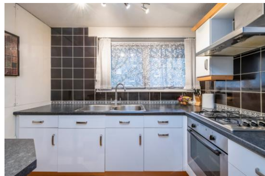
Sage Way London, WC1X