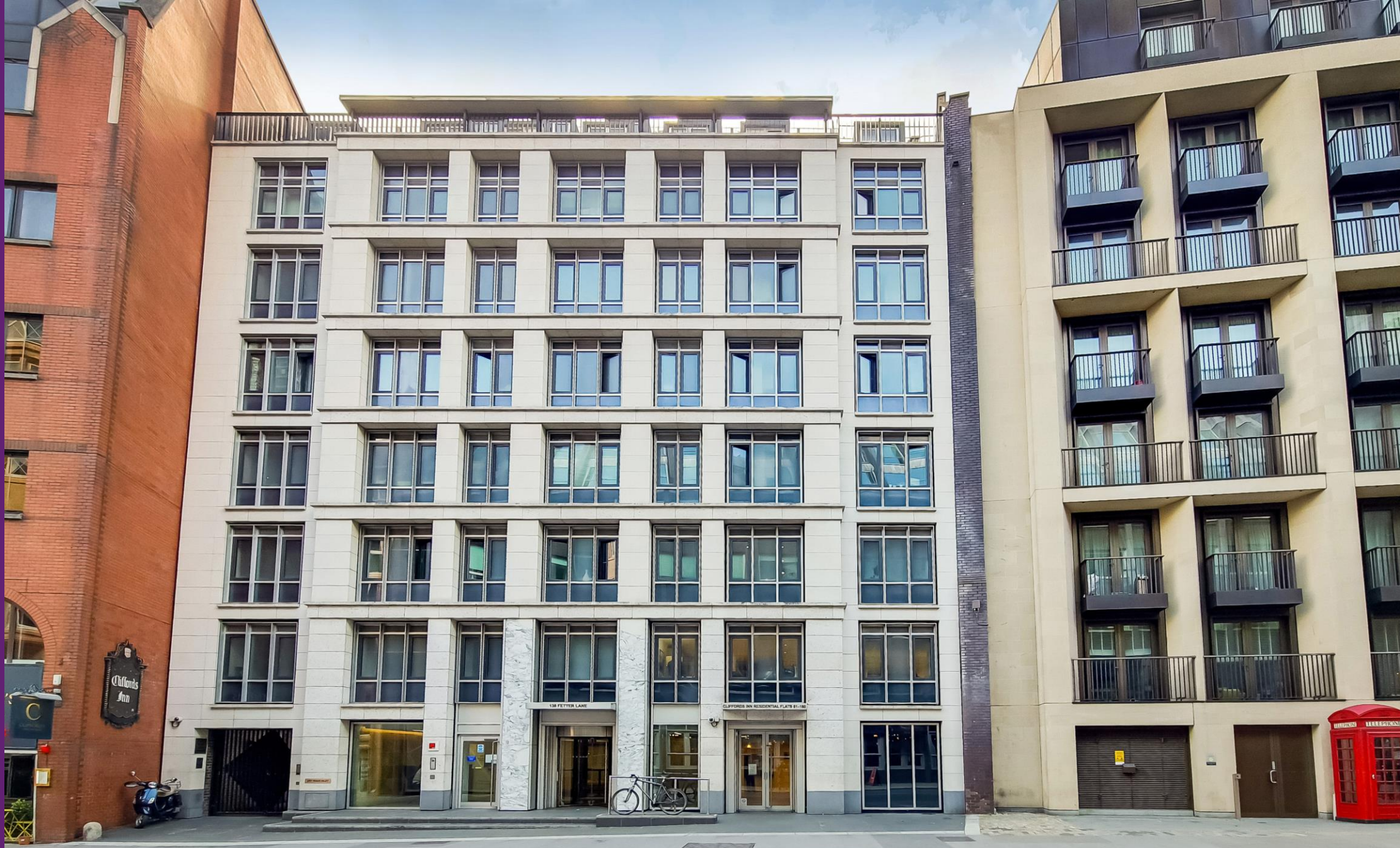
Cliffords Inn Fetter Lane, EC4A