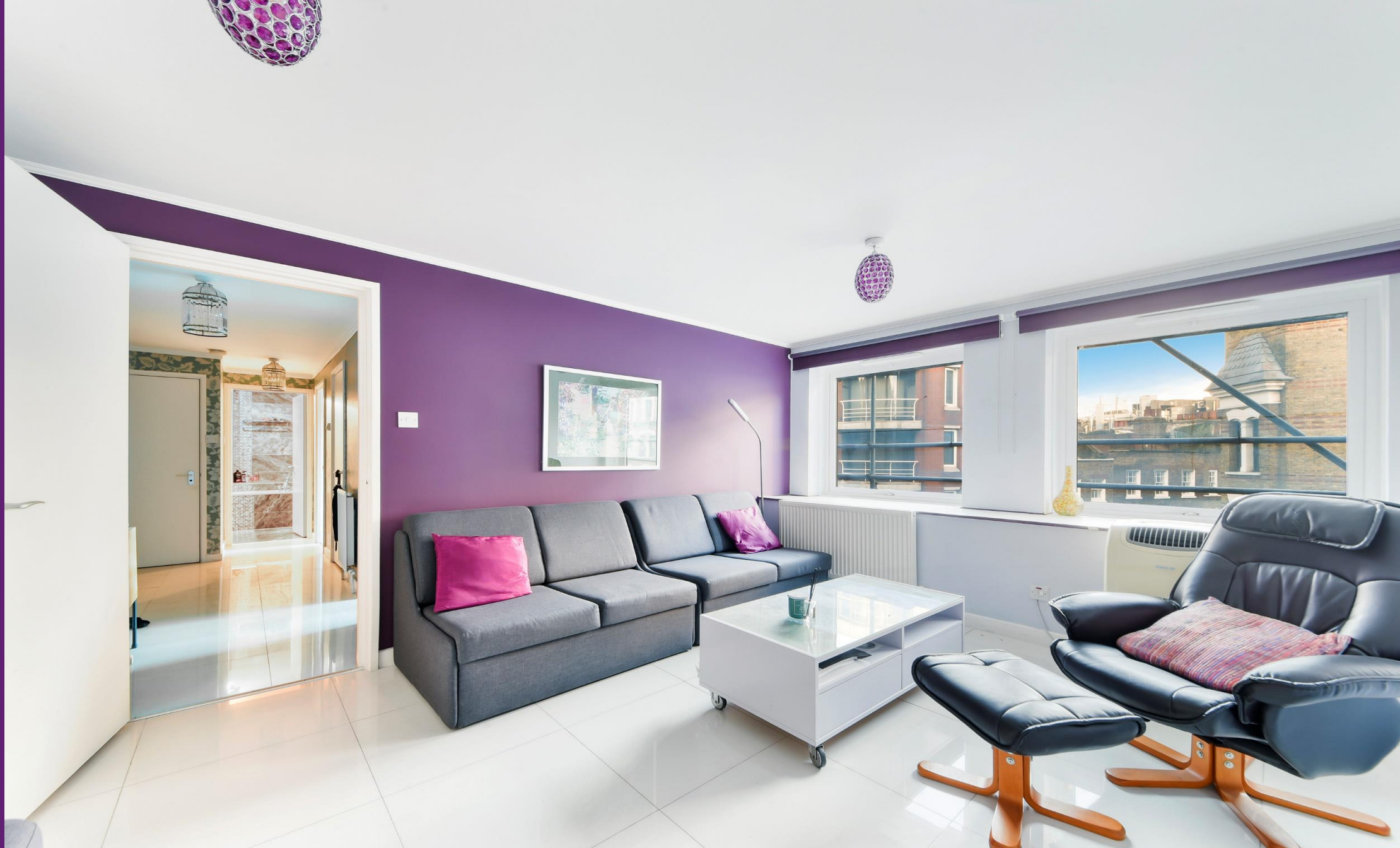
Vale Royal House Charing Cross Road, WC2H