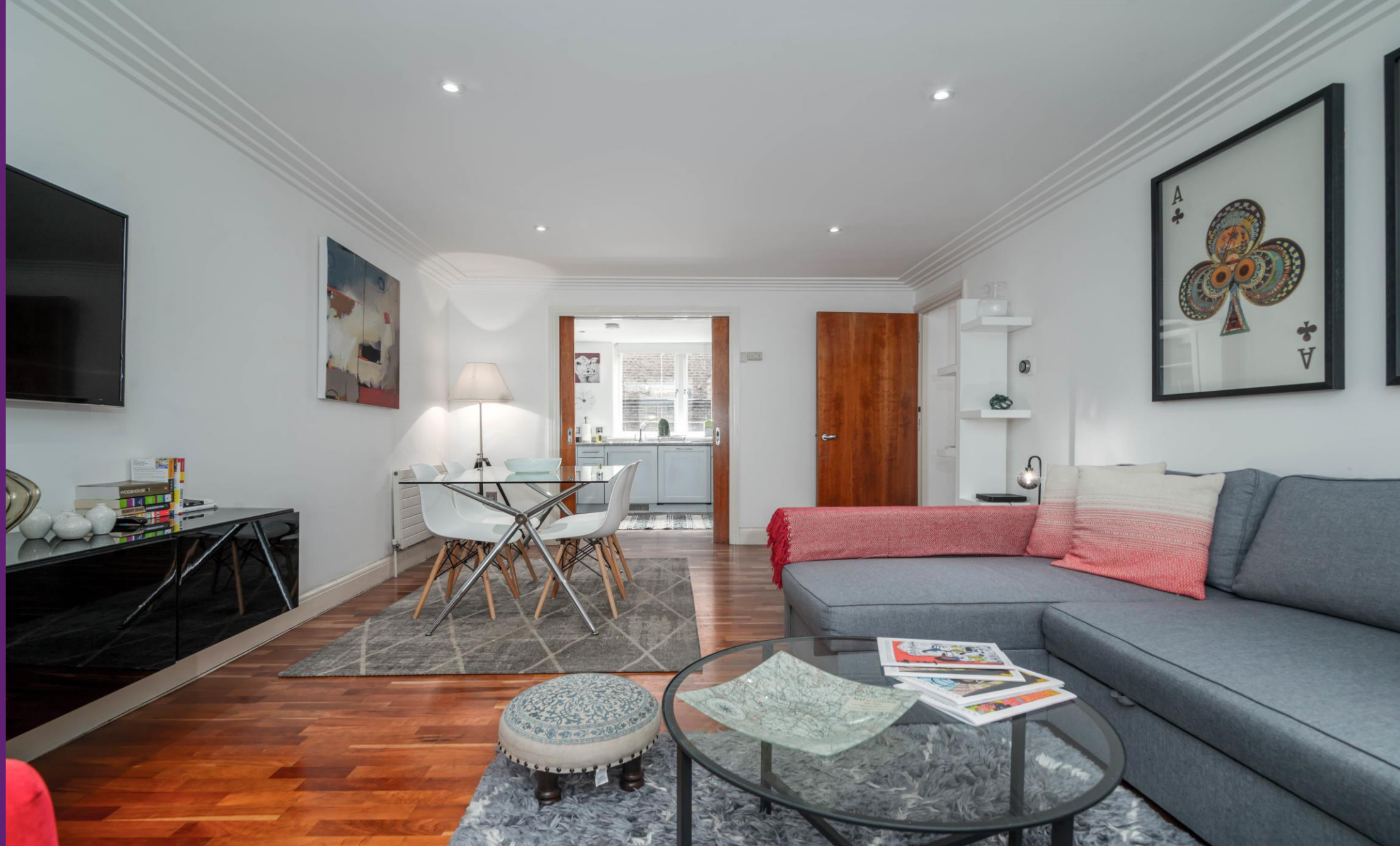
Turner House 6 Exchange Court, WC2R