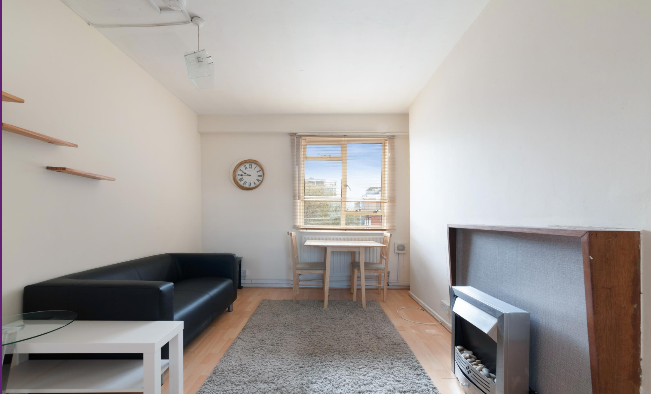
Tresham House Red Lion Square, WC1R