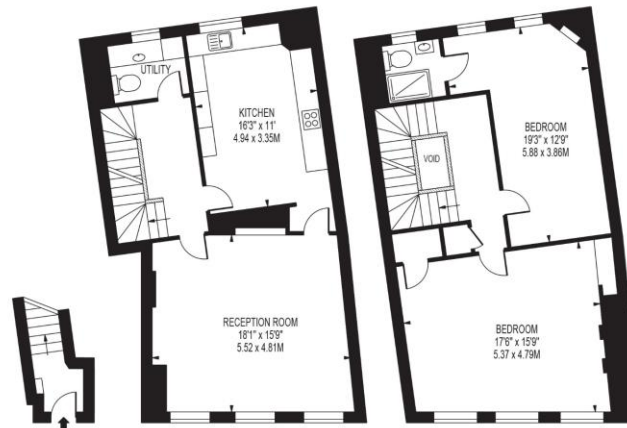
GROUND FLOOR ENTRANCE