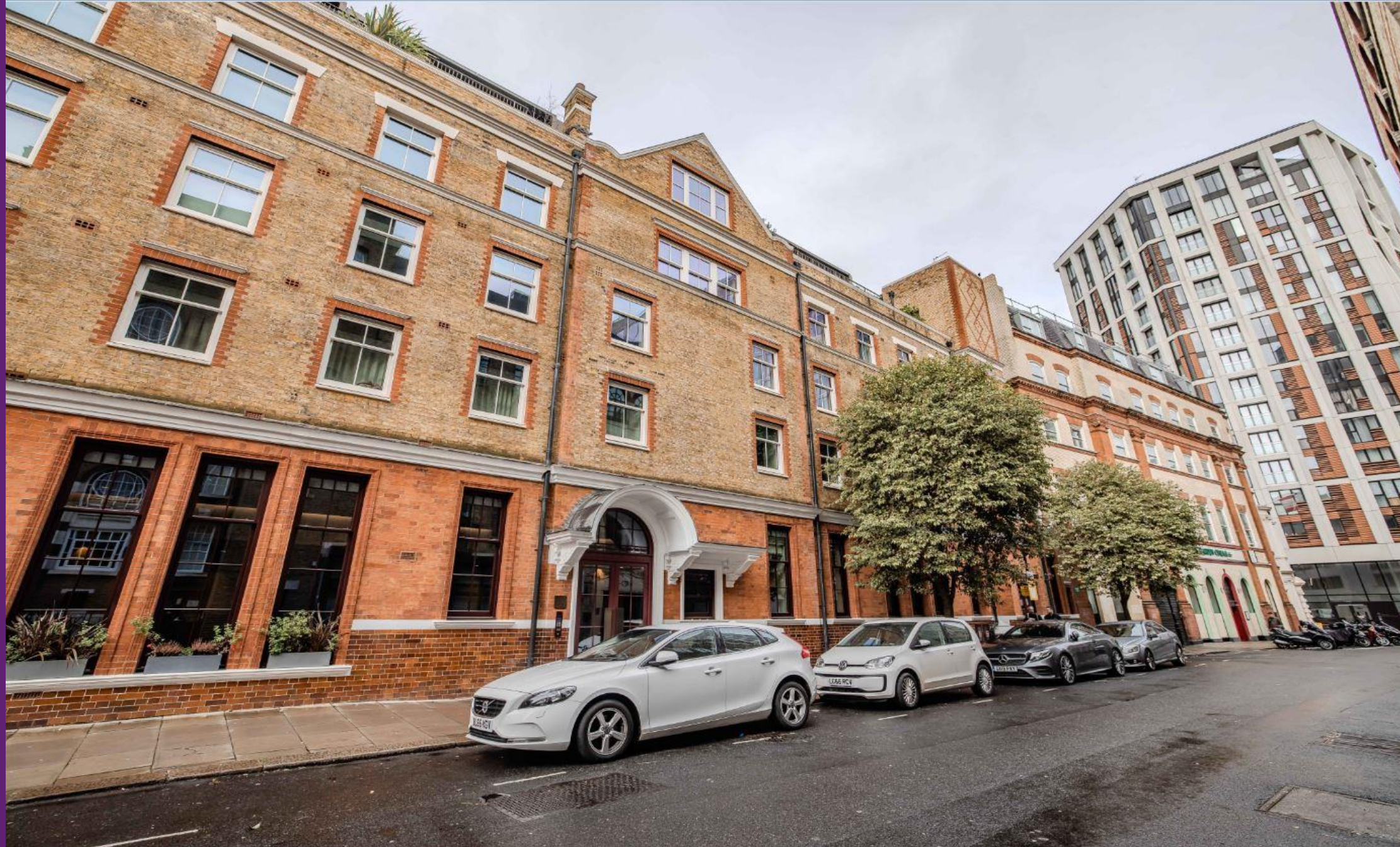
Parker Street Covent Garden, WC2B