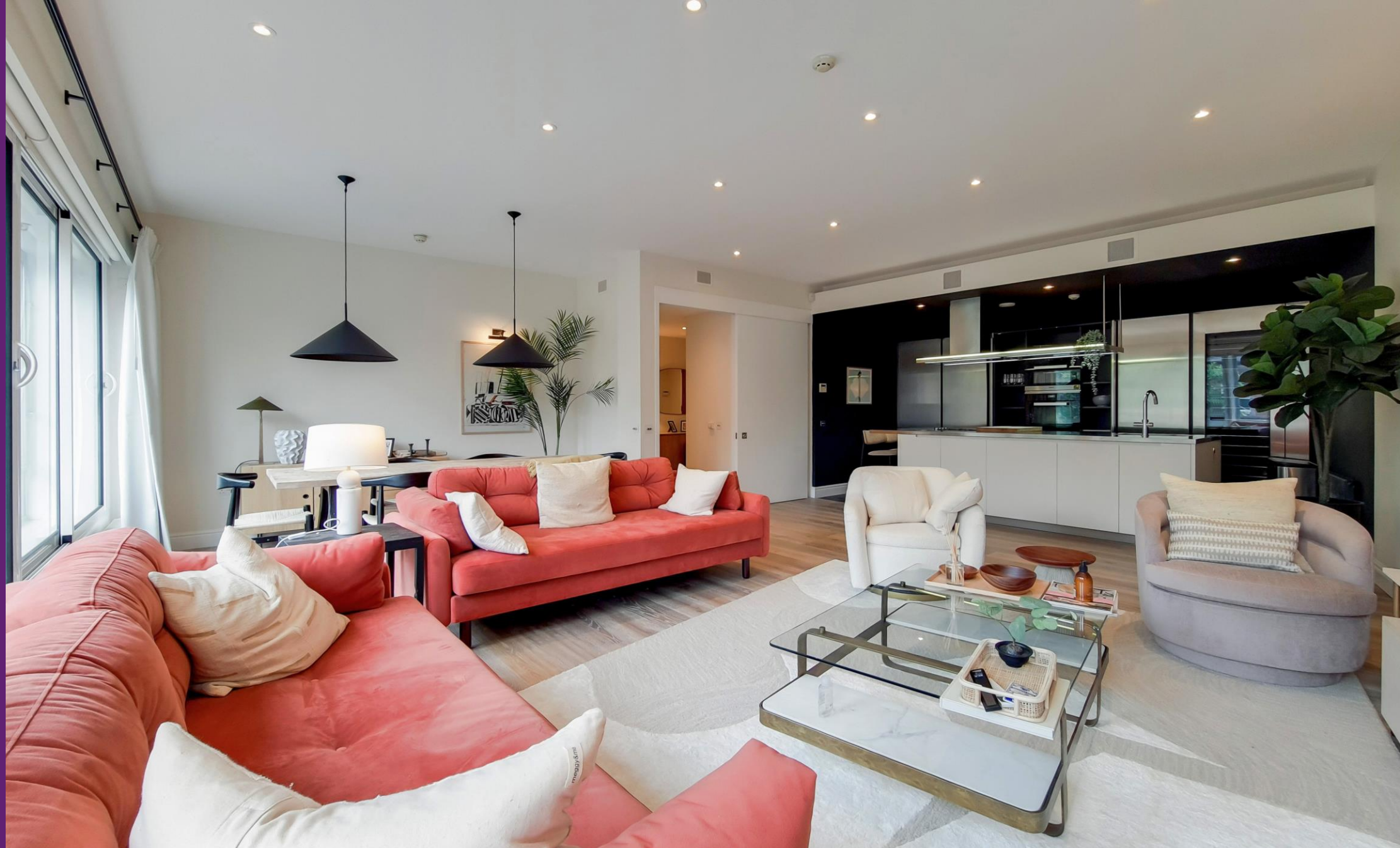
Glass House 175 Shaftesbury Avenue, WC2H